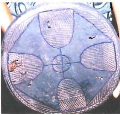
Plate 6: The equal-armed cross in a circle on an Igbo traditional seat for Ozo priest-kings.