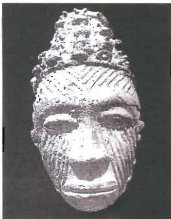
Plate 4a: Igbo Ukwu excavated bronze, Priest-king with Obatala/Eshi facial scarification and crown.