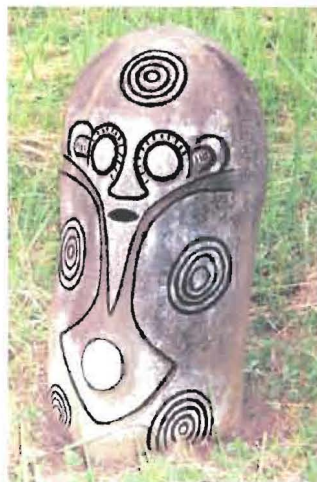
Plate 2: Ikom monolith, Nigeria, whose name spells KHEM. Note the Ogam-like markings.