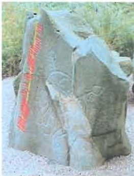
Plate 1; Brandsbutt Ogam in UK.

(Edgar Evans Cayce: Edgar Cayce on Atlantis , 1999). We submit that the 'natives' who populated 'Egypt' before the Atlanteans arrived were Black West Africans and that the royal Priest who first ruled Egypt was the same person after whom Egypt took its name 'Khemet', that the monoliths of Ikom and the lost city of Igbo Ukwu were creations of these ancient Egyptians (Puntites) about whom Cayce had written that the priest-king had commissioned records of Atlantis to be carved on stone by a special electric device and hidden in a number of places on earth around 10,500 and 10,000 B.C. ( Cayce on Atlantis , Chapter 5). This priest-king was Ham, otherwise called Khem! And we have demonstrated in most of our Adam books, that this Egyptian ruling family of Ham spoke the Igbo language. We tracked the origins of language to the beings from Sirius. But that is the subject of another article. Ancient Nigeria mythologies meet with Cayce's readings, but also Hindu and Egyptian mythology in saying that a priest King was banished from his rightful throne in favour of his junior brother. Obatala and Oduduwa in Nigeria, Osiris and Seth in Egypt, Rama and his junior brother in India fit into the duo. Cayce's hero Ra-ta was obviously Ra -ma, the founder of the Great Bha- Rath (India) empire, otherwise called Maha Bharatha, and suggests that the great kingdom of India/Bharat was, as evidenced from accumulated evidence, the same kingdom of Osiris.