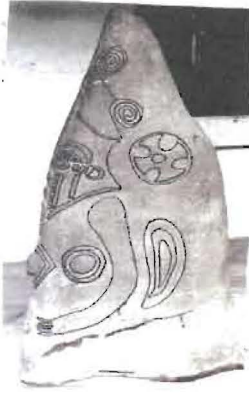
Plate 5b: The Equal-armed cross in a circle on a monolith of Ikom, a landmark of Kwa land - the Center of the earth.