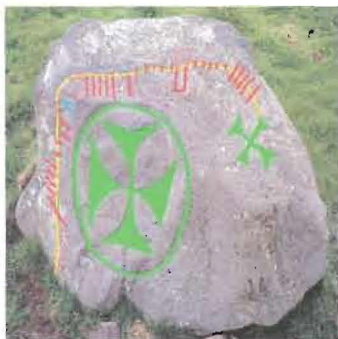
Plate 5a: (Maumanorig Ogam, UK) This equal-armed cross inscribed in a circle is found on a Ogam piece in UK. It is the symbol of Igbo Ozo and of Kwa land (see plates 5b and 6).