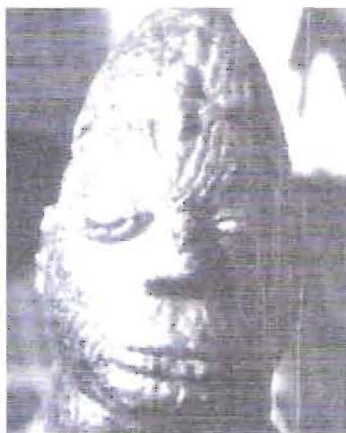
Plate 3b: Kush/Osiris as Obatala/Eshi with the facial scarification borne only by the Igbo people of Nigeria, in which are embedded the five basic lines of Ogam, slanting & straight!