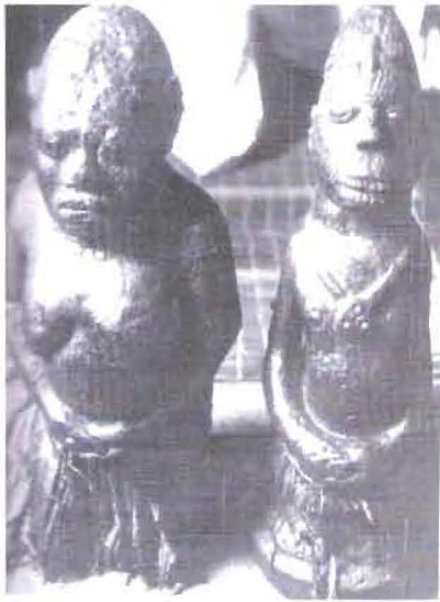
Plate 3: Image of Igbo ancestor Obatala (right) and his wife Yemoja dressed in palm-frond leaves.