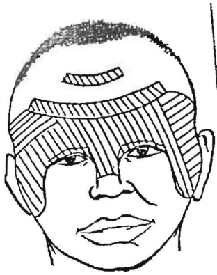
Plate 4b: The winged falcon, sun and moon - facial scarification of Igbo Ozo (Lord) Initiates (Ogam-like slanting and straight lines)