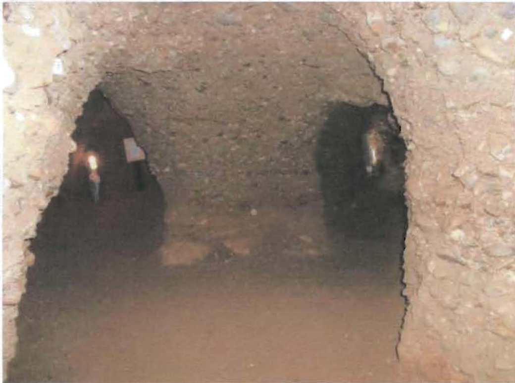
Prehistoric Underground Bosnian Pyramid Labyrinth

At the five International Scientific Conferences on the Bosnian Pyramids held in 2008, 2011, 2012, 2013 and 2014, experts have given interdisciplinary scientific explanations for the healing energy in the pyramid complex. Beneath the pyramid complex in Visoko, in the prehistoric tunnels was measured the constant presence of beneficial electromagnetism, as well as ultrasound of 28 kHz and the Schumann resonance of 7.83 Hz (the best energy field for the physical, mental and spiritual faculties of humankind), an extraordinarily high concentration of negative ions, up to 60,000 per cubic centimeter (ten times the concentration in, for example, the forest on mountains), and the absence of 1) harmful cosmic rays and 2) natural radioactivity. In these conditions, said the scientists, the cells of the human organism can start the self-healing process of regeneration.