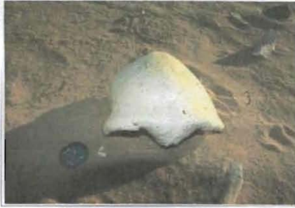
3rd Site Skull

The photos sent of this skull have no comparative scale, nor were measurements taken by the two people who discovered the skull and bones. They were taken aback by the severity of recession above the eyes and did make contact with an academic, but received nothing in return. They then consulted a medical expert who recommended they contact us to get a better response.