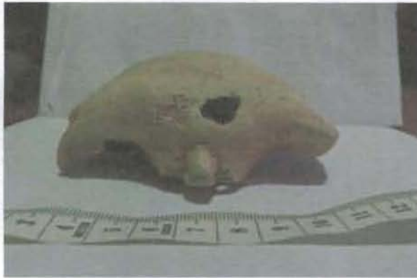
4th Site Skull

As an opening gambit this connection is quite likely, but it is open to question. Not so is the quite intriguing position and shape of the nose of the no-forehead beings. This skull settled that score. We made note of the extremely high positioning of the nose at the burial site, as the face was intact and unbroken, it did seem odd that the nose was seemingly out of position and so prominent. I remember discussing on the phone with one of the two people involved in the reconstruction, this very issue, and I did say that we feel a tractor's blade hit the face of the more robust skull and could have also grazed the no-forehead skull, thus dislodging the nose.