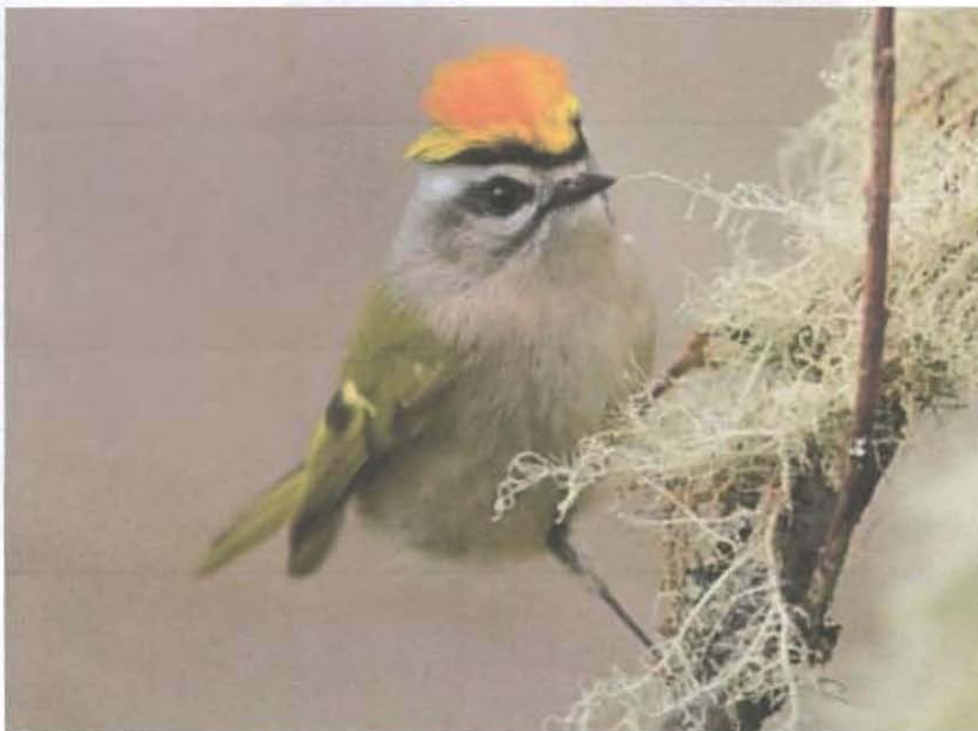
Titmouse-like kinglet (genus Regulus), the paracousse of the Apalachites. Paracousse.

We list here some of the authentic words recorded by French residents in the provinces of the Apalachee Indians circa 1650 together with some speculative derivations.