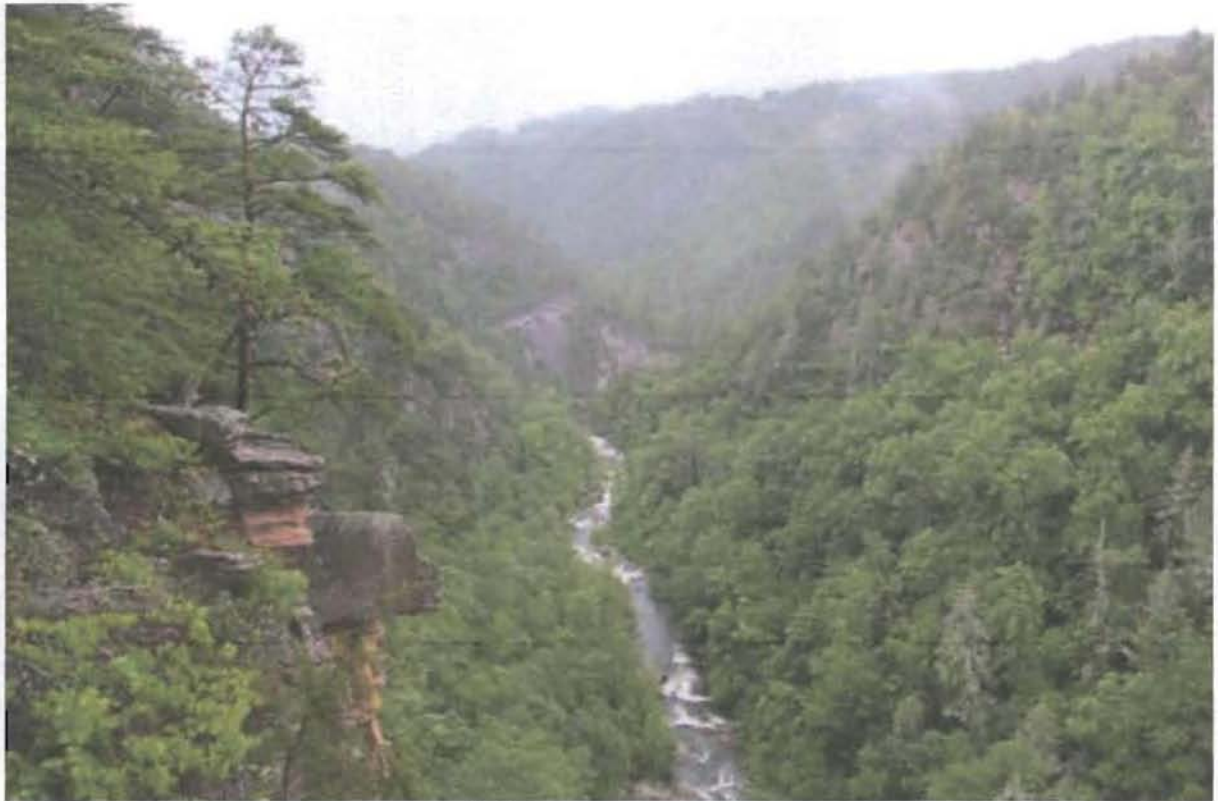
Tallulah Gorge State Park.

DNA of the region also, with numerous high Croatian matches in the ancestry of Cherokees and Lumbee.