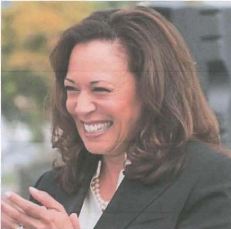
Vice-President Elect Kamala Harris.

The capital of the oldest Indians in Eastern North America was Melilot. Most of the Apalachee Indians' medicinal herbs had Greek names. That appears to be irrefutable. The symbology of "honey lotus" belongs to the Ancient World. But as the name of America's vice president-elect demonstrates, Kamala (Hindu "lotus flower, excellence"), [12] American Indians, Indians and Americans have more in common than they might individually believe. Ethnically and culturally, it is One World and always has been.